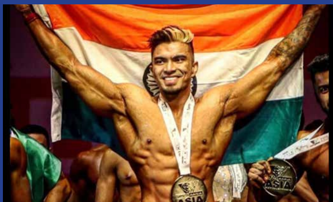
Mr. Muscle Mania Asia (Men's Physique)