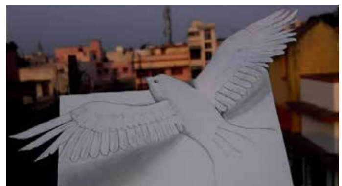
3D art by Sreyashi Dutta, BBA III