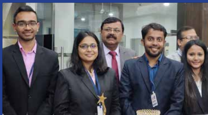
KSOM Students who participated at ZENITH Reward and Recognition Program