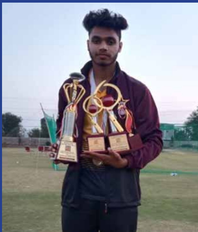
All India VPL4 (Vijayvargiya Premier League)