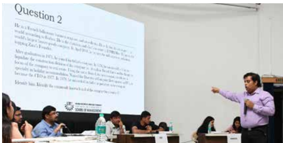
Business Quiz competition in session during Kolosseum