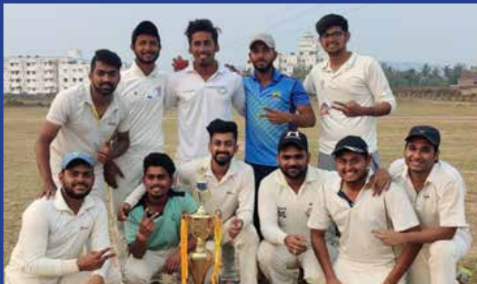
KSOM students in the KIIT Team that emerged winner at GIET, Bhubaneswar