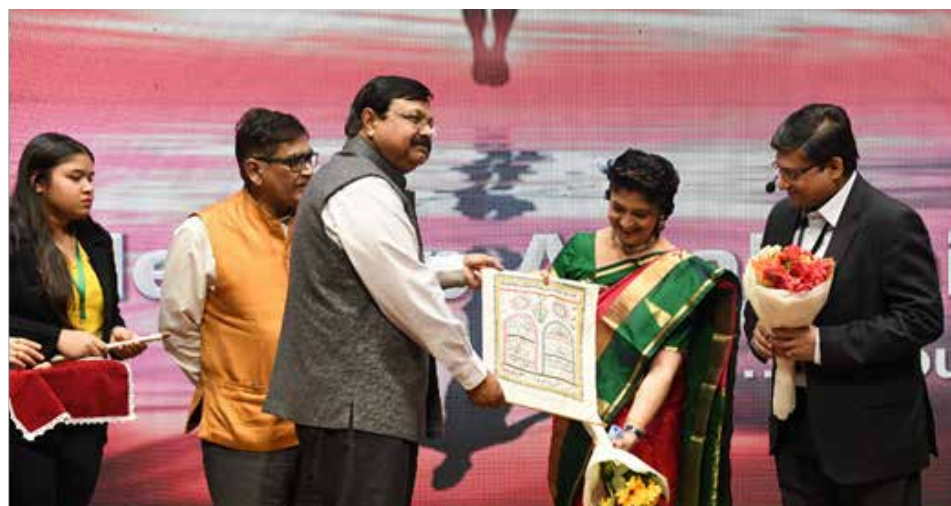
Corporate Musical event during Kolosseum