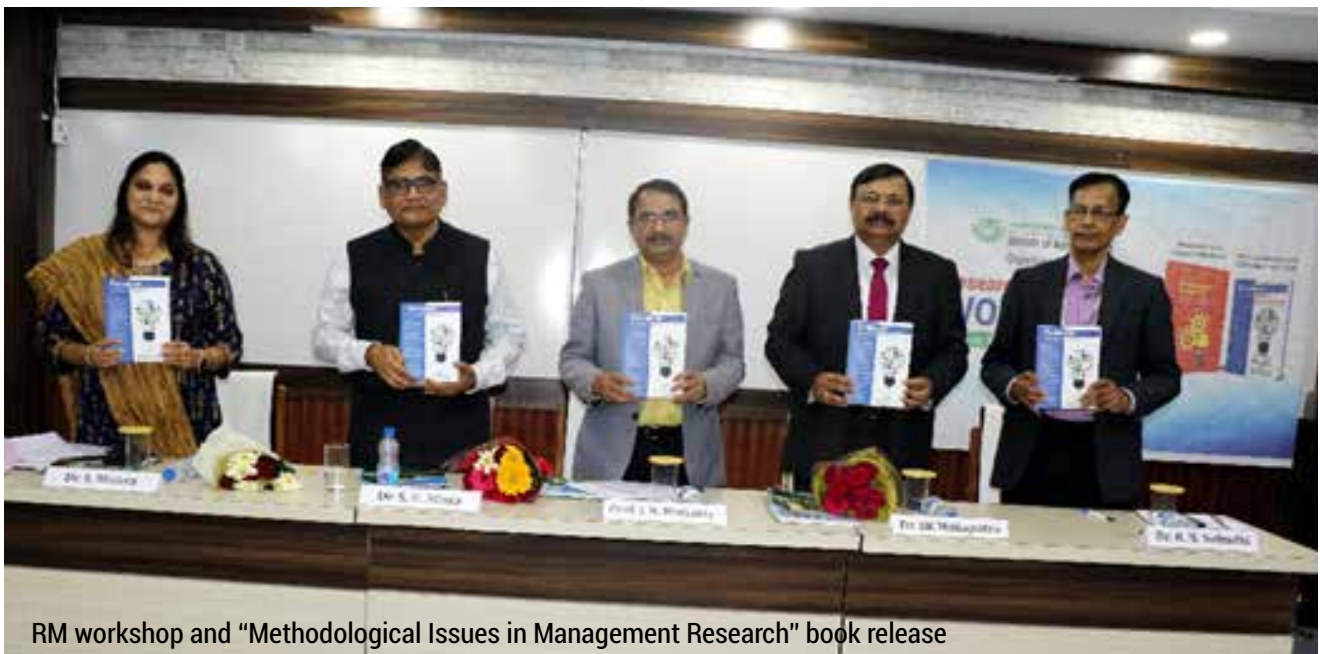
RM workshop and “Methodological Issues in Management Research” book release