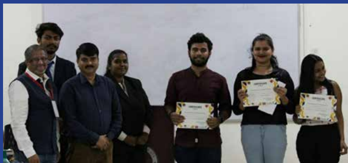
B-Fest "ORION", organized at SRI SRI University