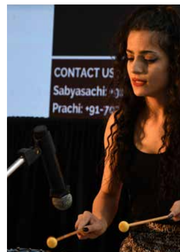
International student of KSOM displaying her talent during Kolosseum