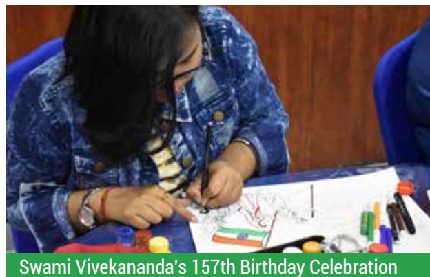
Swami Vivekananda's 157th Birthday Celebration