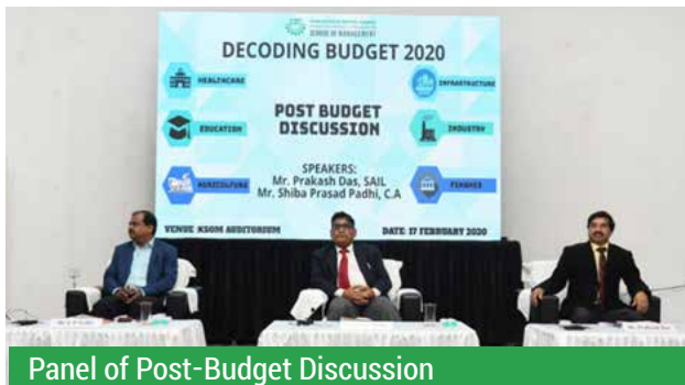
Panel of Post-Budget Discussion