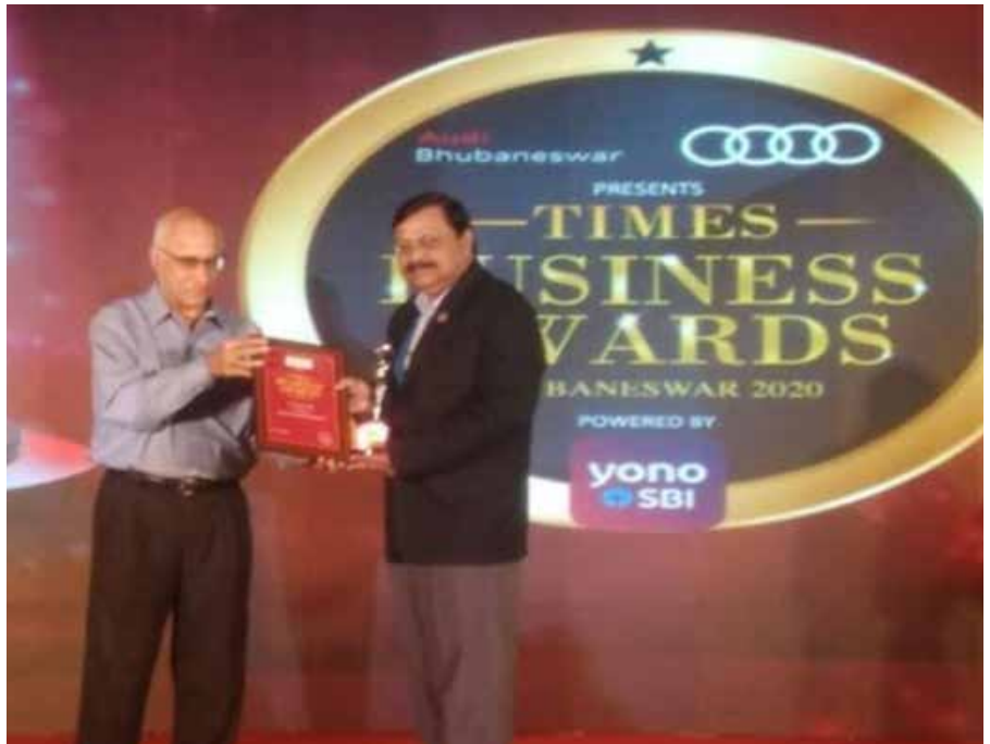
KSOM bags best B school award