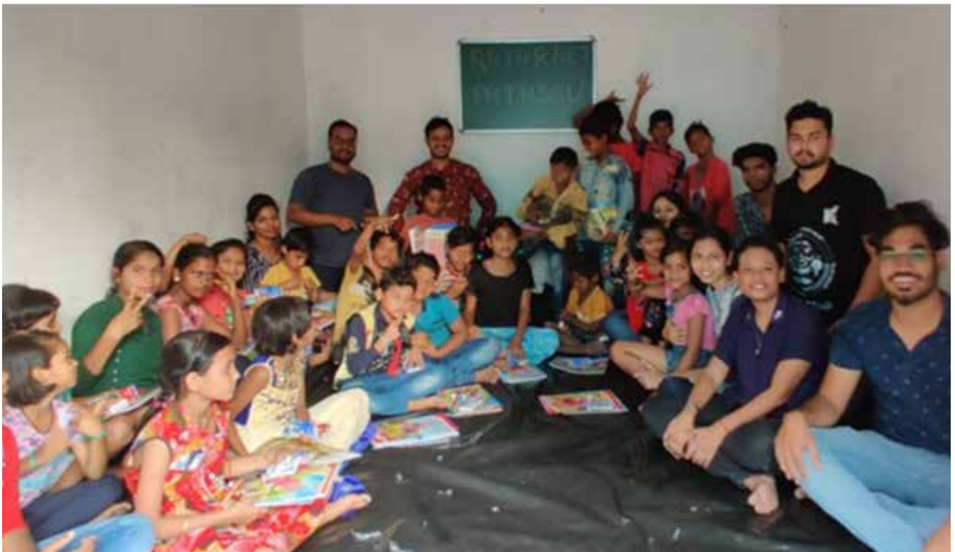
KSOM students spend quality time with kids