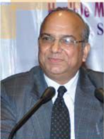
Hon'ble Mr. Justice A. K. Patnaik, Judge, Supreme Court of India