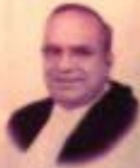
Hon'ble Mr. Justice A. K. Patnaik Judge, Supreme Court of India