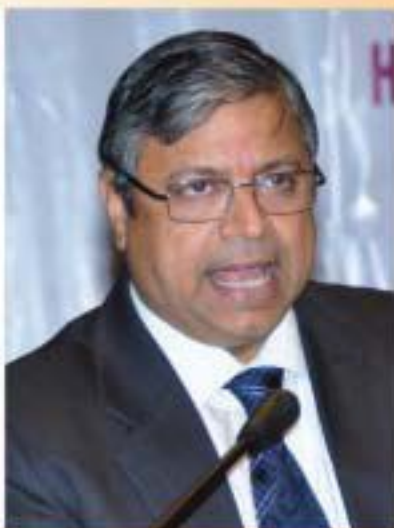
Mr. Gopal Subramaniam, Solicitor General of India & Chairman, BCI