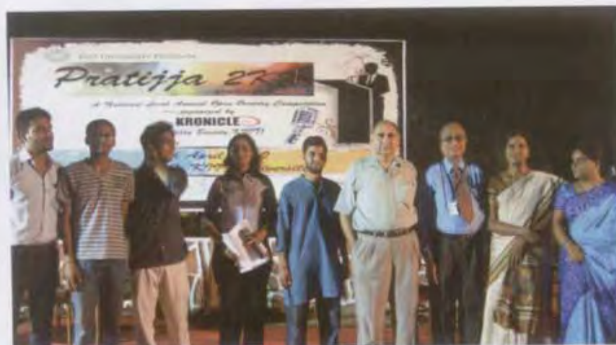
Award ceremony of Pratijja - 2010, a national level open oratory competition, organised by KIIT University Literary Society, Kronicle.