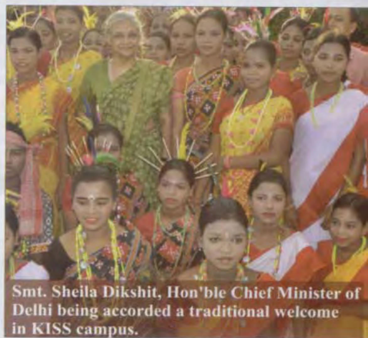
Smt. Sheila Dikshit, Hon'ble Chief Minister of Delhi being accorded a traditional welcome in KISS campus.