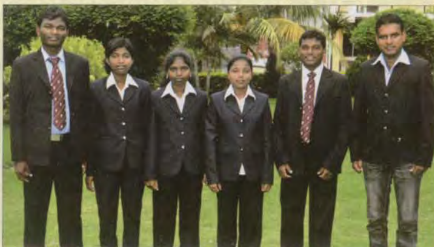
Student-delegation of KISS on a visit to CMRU, Thailand.