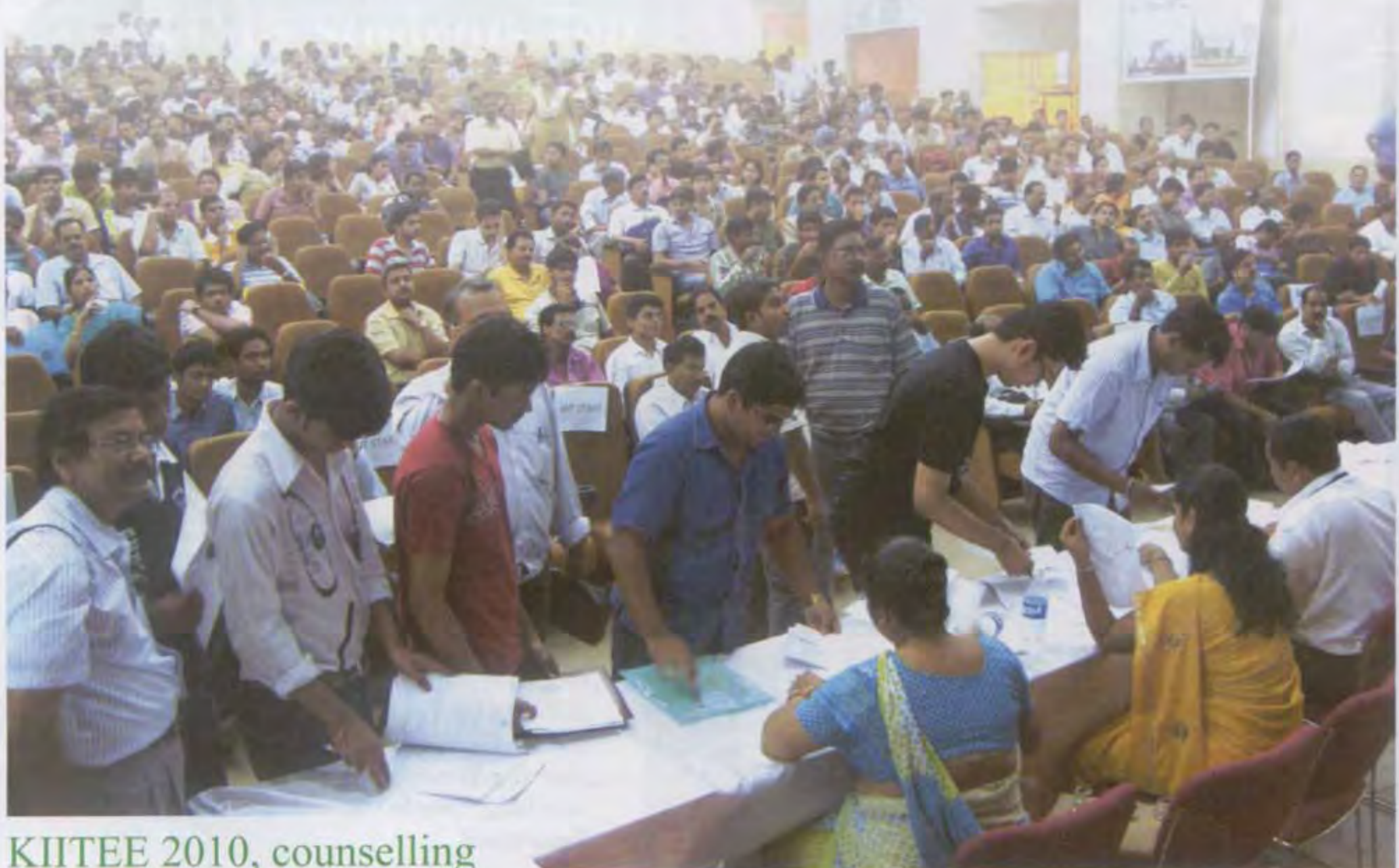
KIITEE 2010, counselling